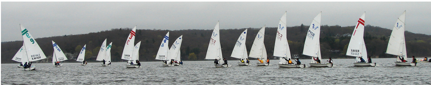
Impromptu 420 race on a cold, foggy spring afternoon at PYC between four schools with over 20 boats:

Daniel Hand HS (Madison), The Williams School (New London), Valley Regional (Deep River, Essex and Chester), and Xavier HS (Middletown).