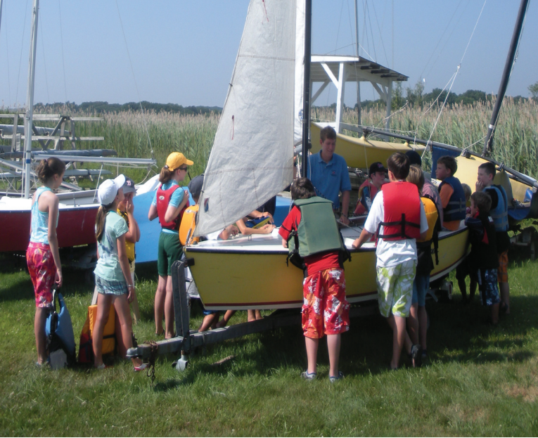
PSA students learning how to rig a Blue Jay.