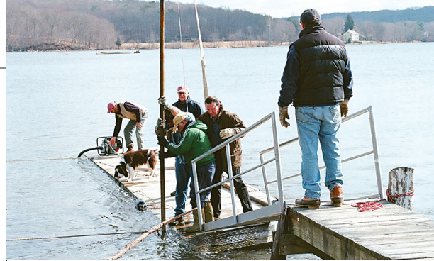
Work party installing docks.

Again, thanks to all of the volunteers, both from this Spring (listed at right) and from last Fall. Your efforts are greatly appreciated!