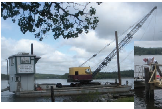
New pilings and dolphins were installed at the north and middle docks along with a much improved ramp.